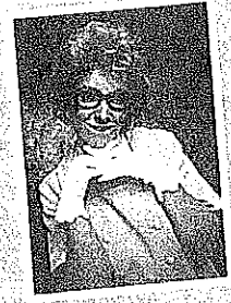
"Martha Marie" (character)

"When those glasses and gloves come off, it's just me."